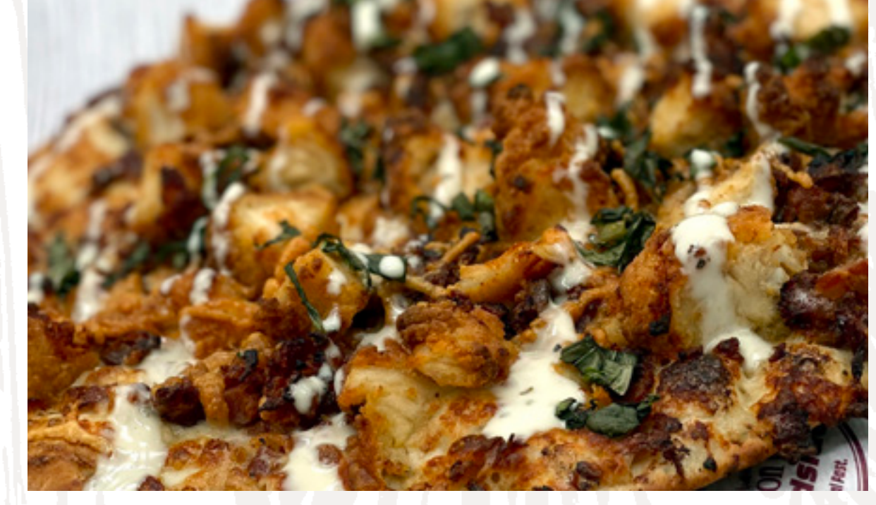
CHICKEN, BACON, RANCH

CRISPY CHICKEN, RED ONION, BLEU CHEESE CRUMBLES & BBQ SAUCE. PERSONAL 10. | LARGE 18.