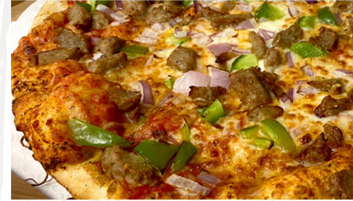
SAUSAGE, PEPPER, ONTON

CRISPY CHICKEN, RED ONION, 5-CHEESE BLEND, GORGONZOLA & BUFFALO SAUCE. PERSONAL 10. | LARGE 18.